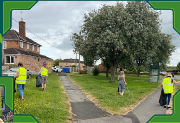
Neighbourhood litter pick June 2023