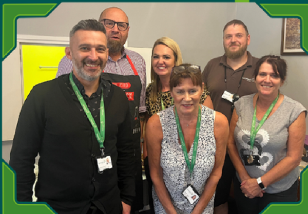
Afternoon tea at Medlicott House July 2023